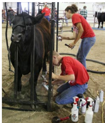
Several 4-H/FFA teams participated in the new Cattle Fitting Contest. They had a half hour to blow, groom and prepare their beef animal for show.