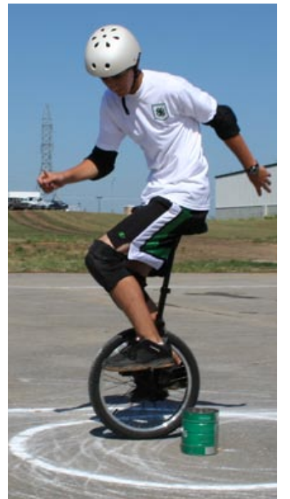
For the first time, a unicycle was entered in the 4-H Bicycle Safety Contest.