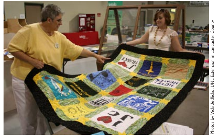
There were 20 entries in the new 4-H project "Quilt Quest." Interview judging is an opportunity for 4-H youth to discuss their project(s) with judges for valuable feedback.