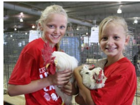
Poultry is one of many 4-H animal projects.