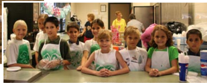
The 4-H Corner Stop concession stand is Lancaster County 4-H Council's main fundraiser each year. More than 130 youth and adults volunteered at the stand this year!