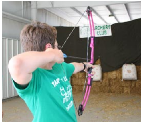
The Lancaster County 4-H Shooting Sports Club presented a BB Gun Shooting Range for the second year in a row. New this year was an Archery Range.

Complete 4-H ribbon results and more photographs are online at http://lanaster.unl.edu/4h/Fair