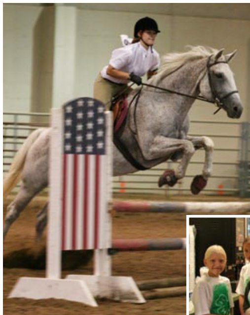
The Lancaster County Fair has the largest 4-H county fair horse show in Nebraska, with 31 events spanning five days.