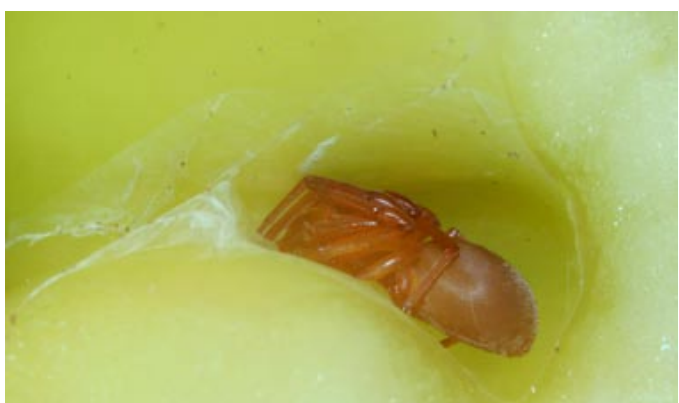
Barb Ogg, UNL Extension in Lancaster County