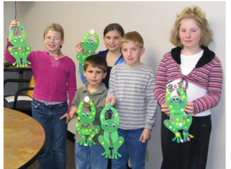
The 4-H Explorers club started last year.

Nebraska 4-H has more than 150 project areas. Age-appropriate project manuals are written by university experts. Most project manuals have accompanying leader guides.