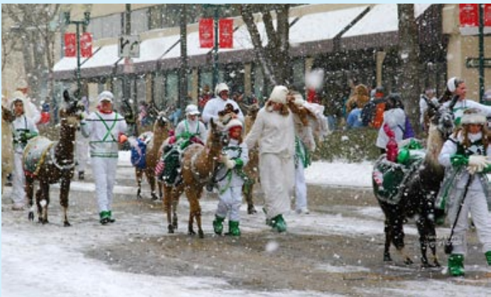
Pictured is the 2005 4-H entry in the Star City Parade.