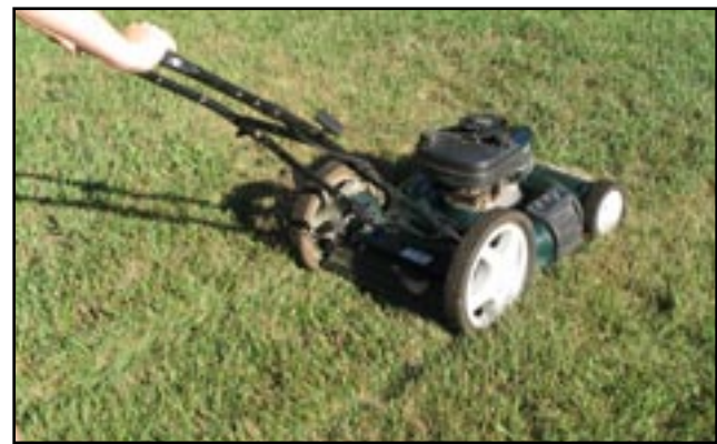
Veiki Jedlicka, UNL Extension in Lancaster County

Returning clippings to the lawn usually means mowing more than once a week during the few weeks of rapid growth in spring and early summer. Grass clippings should be less than one inch, or no more than one-third of the total plant height, to ensure rapid decomposition. Mowing more frequently is not as much extra work as you might think, because lawns mowed at the proper height cut more easily and quickly. Mowing infrequently damages the lawn by removing too much of the plant at one time. When mowed regularly, clippings filter down through the grass, decompose rapidly and recycle nutrients back into the soil.