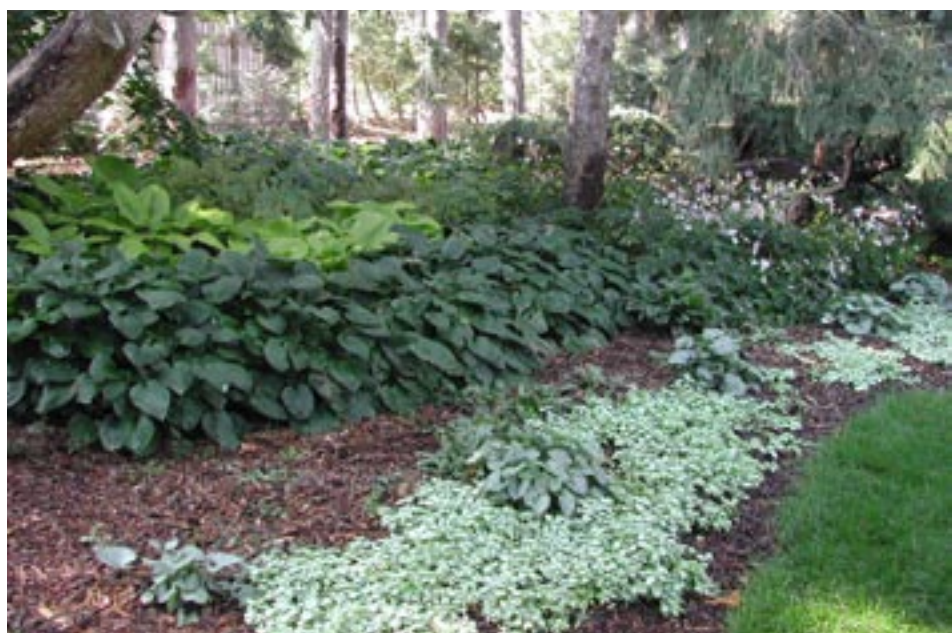
Reduce impractical lawn areas by using ground covers such as hostas and lamium.

Landscaping the Border of Your Yard — Perimeter plantings provide a convenient place to recycle tree trim-