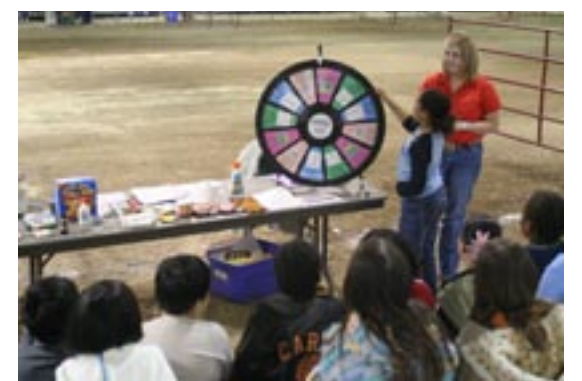
Students learned basic food safety practices, such as always thaw frozen meat in a refrigerator, not at room temperature.