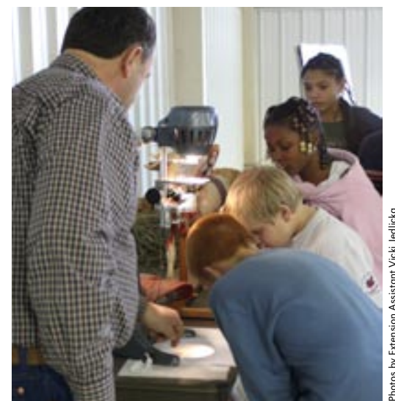
In Ruminant Nutrition, youth observed live microorganisms from a cow's stomach under a microscope.