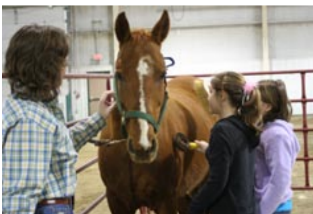
Students tried their hand at grooming a horse.