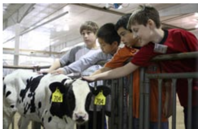
Youth learned about dairy calves.