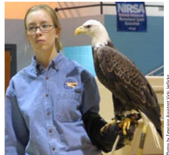
Special presentations by the World Bird Sanctuary of St. Louis included raptors, owls, reptiles and a bald eagle.