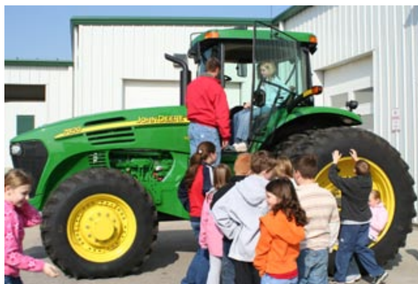
In the Farming Technology session, students compared farming methods from 100 years ago with current farm equipment.

The Ag Awareness Coalition, led by University of Nebraska-Lincoln Extension, organizes the festival with the help of agriculture businesses, commodity associations and food industry companies.