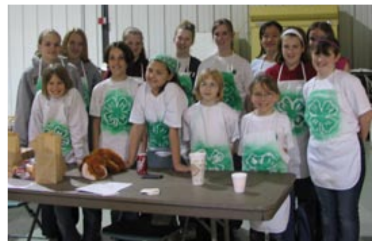
Club members wore the new aprons at the 4-H Spring Rabbit Show which Rabbits 'R' Us presents every year.