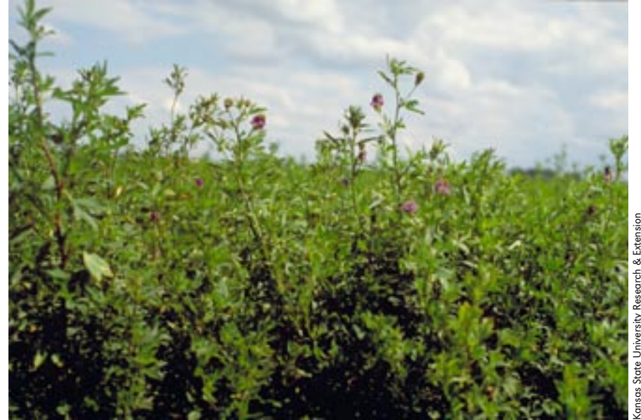
Kansas State University Research & Extension

The best time for fall seeding alfalfa in eastern Nebraska is during the month of August, provided adequate soil moisture is available. Farmers sometimes wait until mid- or late-September to plant alfalfa. This is most often too late because the plants do not have a chance to become established before the first killing frost. The latest alfalfa should