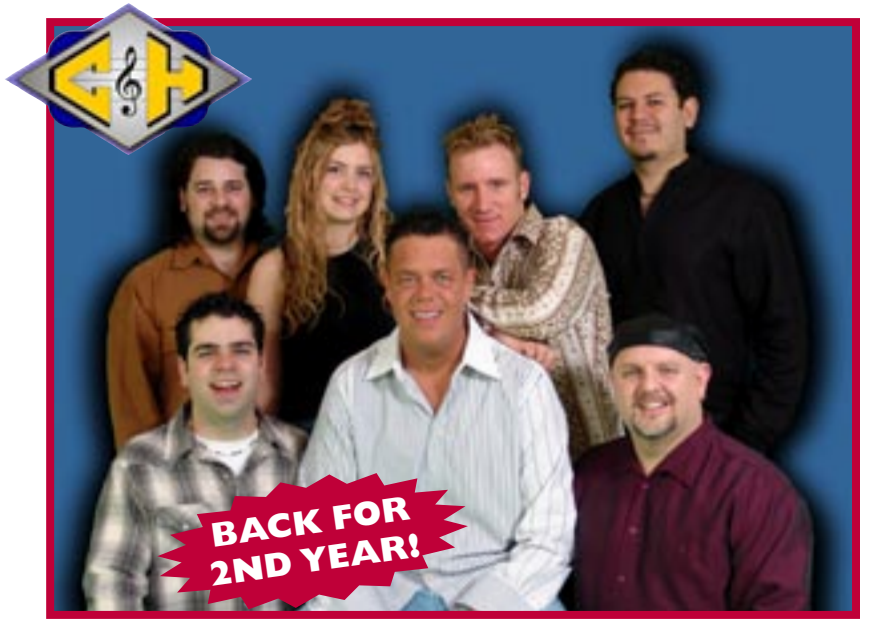
Enjoy a FREE concert on Thursday, August 3 at 9 p.m. featuring Lincoln's own Cactus Hill, which has been voted #1 country group in the Midwest!

FREE entertainment! Considered by many as the most entertaining ensemble around, Cactus Hill is performing at the Lancaster County Fair for the second year in a row. They recently released their debut CD, "A Long Long Way." Based in Lincoln, Cactus Hill has played aside Nashville notables such as Lonestar, Brad Paisley, Rascal Flatts, Montgomery Gentry, Gary Allan, Phil Vassar, Joe Nichols, Chris Ledoux, Mark Wills, Darryl Worley and Blake Shelton, just to name a few. SPONSORED BY DESIGN ASSOCIATES