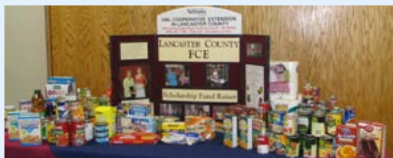
172 pounds of food was collected for the Food Bank.