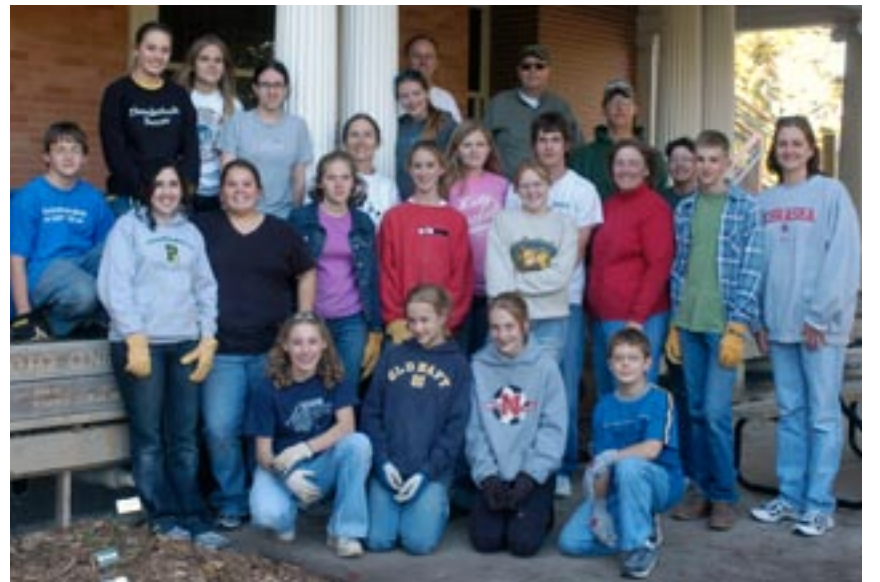
4-H Teen Council members and parents who helped with the project.

Note: For more photos, go to the 4-H Web site at http://lanaster.unl.edu .