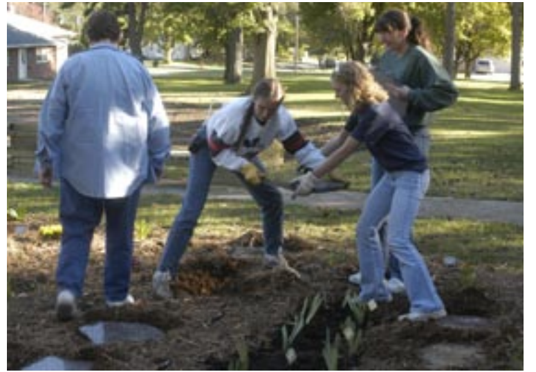
Members of 4-H Teen Council shaped and placed granite stepping stones in the garden.