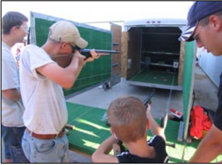
New at this year's fair was a 4-H Air Rifle Shooting Trailer presented by the Lancaster County Shooting Sports 4-H Club. Certified instructors supervised youth at the mobile shooting range.

See page 8 for a complete list of 4-H sponsors.