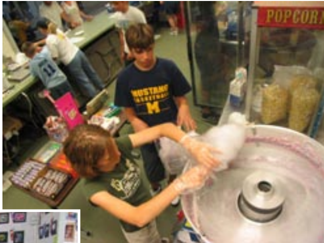
Cotton Clover Candy at the 4-H Corner Stop concession stand sold well.