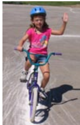
Right signal during the 4-H Bicycle Safety Contest.