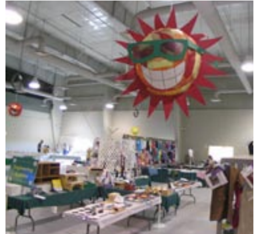
Members of the Carpe Diem 4-H club created a dozen Fun Sun Pinatas as "Summer Blast!" fair theme decorations.