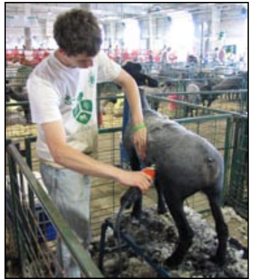
Proper grooming is an essential part of showing animals.