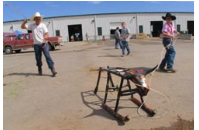
How do you rope a steer? Practice, practice, practice!