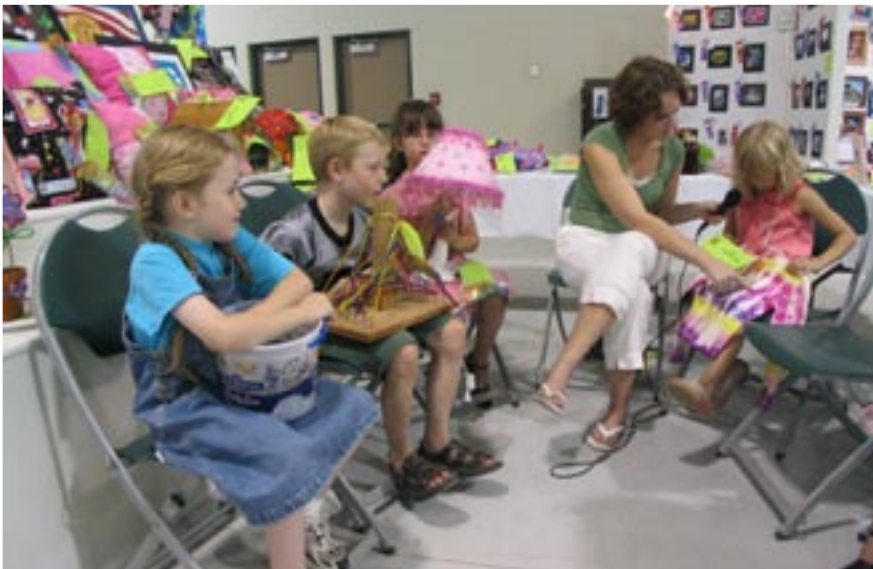
One of the more colorful corners of the fair was the 4-H Clover Kids (ages 5-7) static exhibits. Several youth shared their projects during Clover Kids Show & Tell.