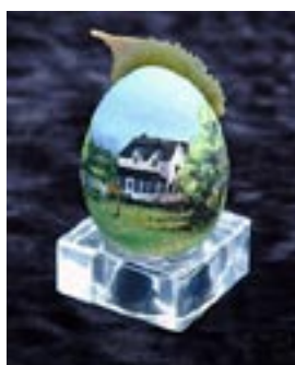
By Veronica Kiuntke of Columbus — A real cottonwood leaf adorns this egg. The Eastern Cottonwood is Nebraska's state tree.