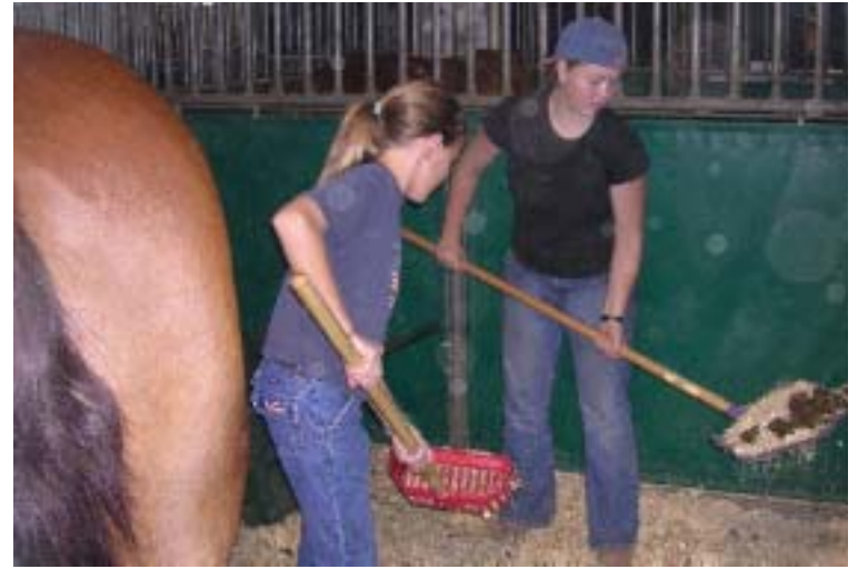
Club members participate in herdsmanship duties at the Lancaster County Fair.