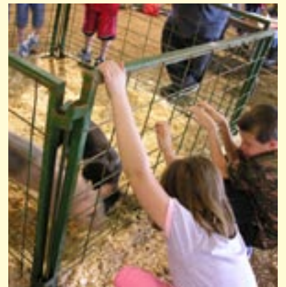
Youth take an up close look at two young gilts (female swine).