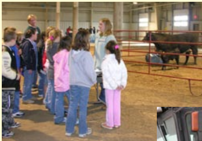
This angus-cross heifer (above) patiently chews her cud as students rotate between sessions. Her three-week-old calf weighed approximately 80 pounds at birth.