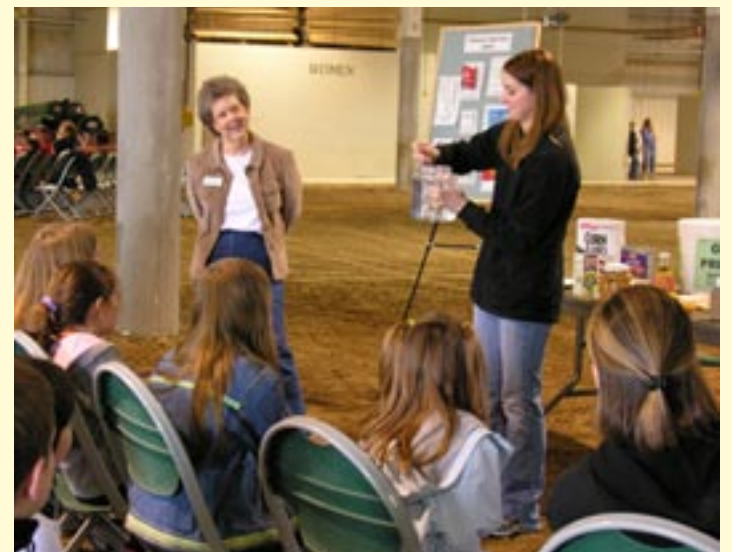
Packing peanuts which dissolve in water are just one example of a corn byproduct.

The Ag Awareness Coalition, led by University of Nebraska Cooperative Extension, organizes the festival with the help of agriculture businesses, commodity associations and food industry companies.