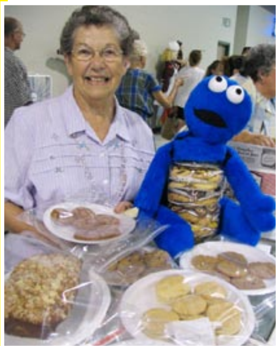
Anyone ages 6 and up is invited to enter an exhibit or participate in a contest. Start planning now for next year's Lancaster County Fair, Aug. 2-6, 2006!