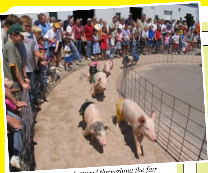
Racing pigs are featured throughout the fair. Come cheer which racing pig you think will finish first!