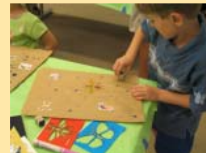
At the 4-H wildlife workshop, youth made tracks with animal paw print stamps, stickers and stencils.

Lancaster County 4-H and Lincoln City Libraries (LCL) initiated a partnership. In this first year: