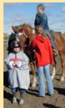
One eager member of the Lincoln Broomtails donned cowboy boots and a bicycle helmet for her first horse ride.

Lancaster County 4-H started its first "horseless horse" club (second in the state) for youth without horses who want to participate in a 4-H horse project. The Lincoln Broomtails 4-H club currently has 10 members who do activities such as researching horse breeds and participating in herdsman duties at County Fair. The Riding Wranglers 4-H club recently gave members of the Lincoln Broomtails an opportunity to ride by sharing their horses with them.