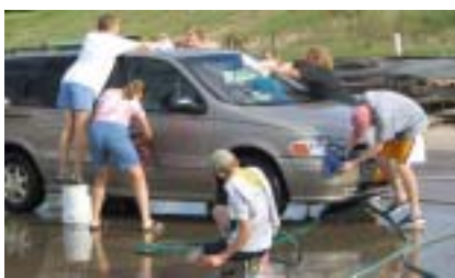
By next June, 51 CWF'ers will have raised a total of $97,818 through various fundraisers for their June 2005 trip to Washington D.C.