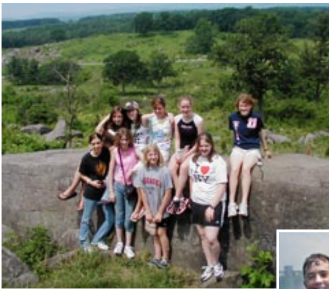
A lookout point on Gettysburg battlefield