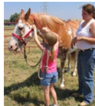
Putting a halter on is part of learning about "A Horse Of Course."