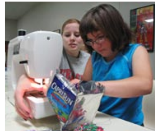
Creating a "Jazzy Juice Pouch Purse" isn't a snap, but can be done with a little sewing!