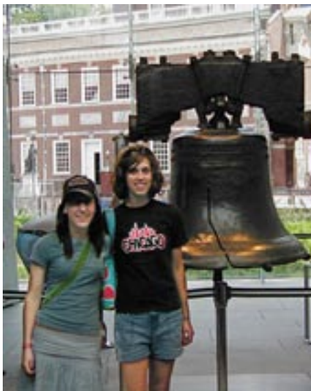
Independence Hall, Philadelphia