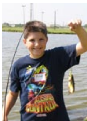
"Fishing Fun" at Oak Lake.