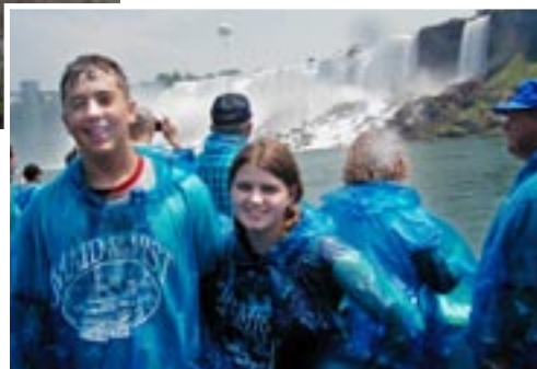
On board the Maid of the Mist, Niagara Falls