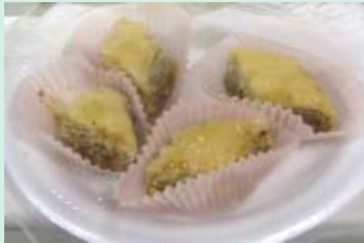
YUMMIEST LOOKING FOOD ITEM Baklava made by Evan Kucera