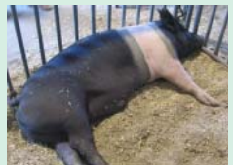
MOST RELAXED SWINE Hampshire owned by Kyle Doeschot