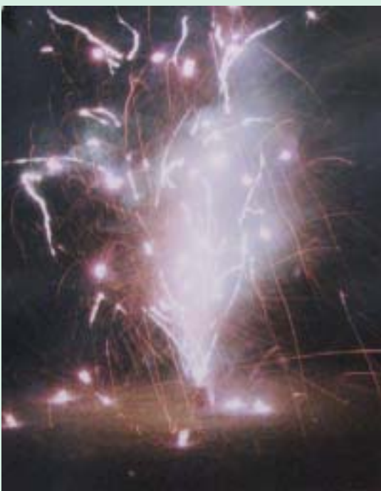
POSTER OR PHOTO WITH MOST PIZZAZZ Photo of fireworks by Amanda Peterson