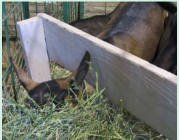
GOAT WITH SILLIEST TABLE MANNERS Oberhasli goat exhibited by Will Keech