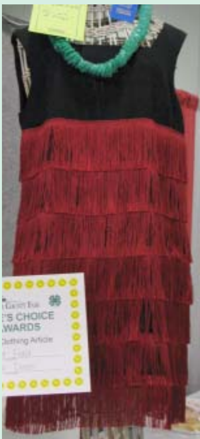
CRAZIEST CLOTHING ARTICLE Flapper dress by Alyssa Fiala