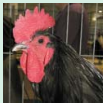
NOISIEST ROOSTER Australorp exhibited by Victoria Norton