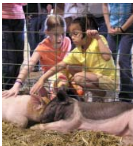
Youth met a pair of 5-week-old piglets.