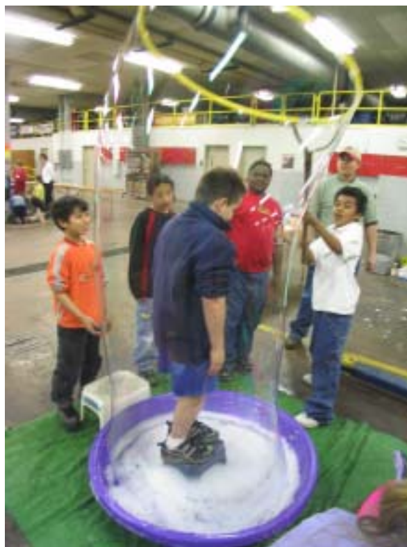
(Right) Youth learned about water quality through the study of bubbles in "Bubbology."

Hundreds of volunteers, area educators, environmentalists, government representatives, as well as donations from local businesses, make this educational experience possible. The earth wellness festival steering committee is comprised of ten local educational resource agencies, including University of Cooperative Extension in Lancaster County.