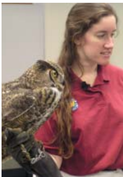
Featured presentations by the World Bird Sanctuary from St. Louis included owls, raptors, turkey vultures, spiders and snakes.