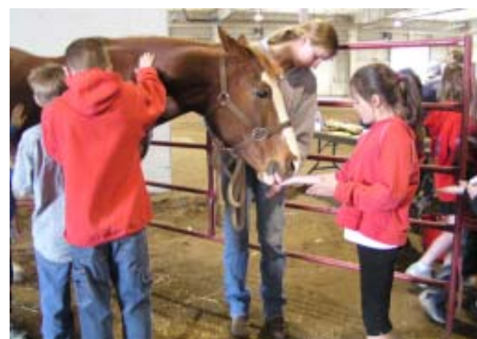
Students learned about breeds and care of horses.