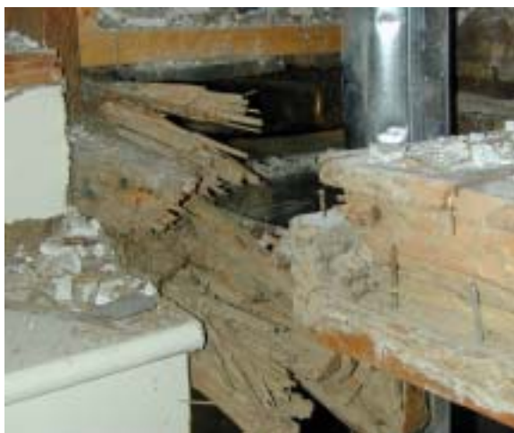
Termite Damage to House Beam

The goal of these workshops is to educate homeowners so they can make better decisions and get effective treatments. In the last nine years, more than 1,450 people have attended 35 workshops. Results from a survey of persons attending these workshop indicate 98 percent of attendees had more confidence in their decision-making abilities after attending the workshop.