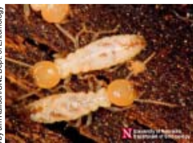
Subterranean Termite Workers

One woman who recently called the extension office about termite treatments, asked, "How do ordinary people make decisions about termite treatments when the companies make such