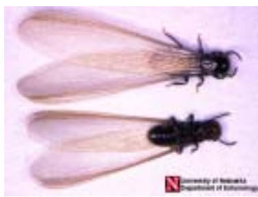
Subterranean Termite Winged Reproductives

2. Have your house inspected. It is important to know if there is a termite infestation inside your home.