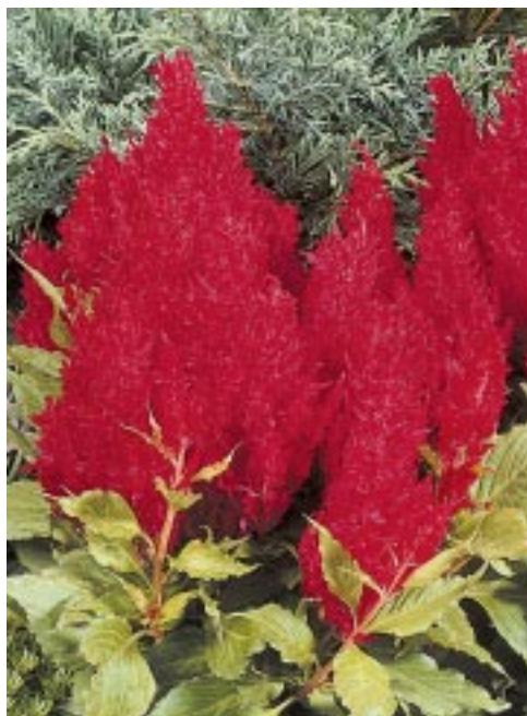
Celosia plumosa 'Fresh Look Red'

'Limbo Violet' differs from all other single grandiflora petunias as a unique combination of large flowers on a compact see SELECTIONS on page 12