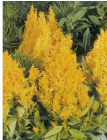
Celosia plumosa 'Fresh Look Yellow'

Celosia plumosa 'Fresh Look Yellow' Flower Award Winner