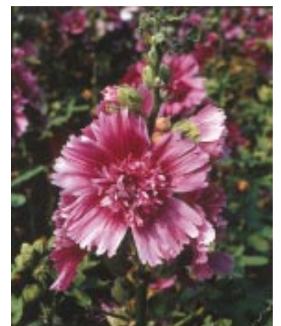
Hollyhock 'Queeny Purple'

dainty, rose-like blooms. This new variety showed several improvements over comparisons. The flower form is double and semi-double, is a darker rose color and is a larger size, up to 3/8 of an inch. The plant produces a higher number of blooms over a longer flowering season. 'Gypsy Deep Rose' forms an enchanting mounded plant with a height of 8 to 10 inches, spreading 12 to 14 inches. This diminutive plant prefers full sun and adapts to container culture. 'Gypsy Deep Rose' is easily grown from seed or bedding plants. Plants require little maintenance. Gypsophila is often associated with weddings because of their use in bridal bouquets.