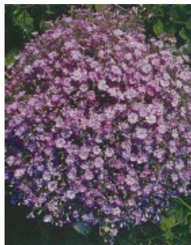
Gypsophila 'Gypsy Deep Rose'

'Fresh Look Red' performs like a fresh floral arrangement all summer. Thriving in the summer heat and humidity with drought or rainy conditions, 'Fresh Look Red' decorates a garden or patio container with rosy red plumes. It won the coveted Gold Medal for its consistent performance with minimal maintenance and pest-free growth. 'Fresh Look Red' covers up spent plumes by producing new foliage and blooms. The plant always looks fresh, needing no grooming. When grown in the full sun, 'Fresh Look Red' plants mature at 12 to 18 inches tall and spread 12 to 20 inches. The central plume can be 8 to 10 inches tall and 5 inches wide. Like all Celosia plumosa , the flowers can be cut and dried for everlasting homemade bouquets.