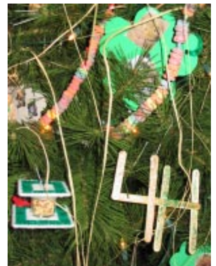
4-H'ers decorated hundreds of ornaments for Heritage League's Holiday of Trees fundraising event.

4-H'ers created homemade ornaments and decorated three trees: "4-H is Alive at the County Fair," "4-H Memories" and "The Wild Side of 4-H." Funds benefitted the Salvation Army After School Hot Lunch Program.