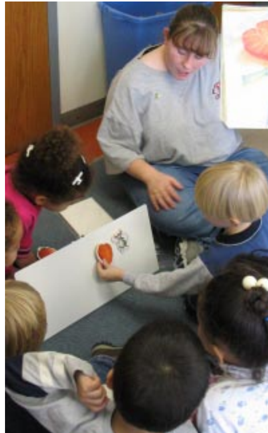
Preschoolers at Carol Youkam Early Head Start place picture pieces on a magnet board as the book "Big Hungry Bear" is read to them. This activity is part of the "Fun With Fruit" kit developed by the Nutrition Education Program.

More than 400 youth participated in kit-related activities.