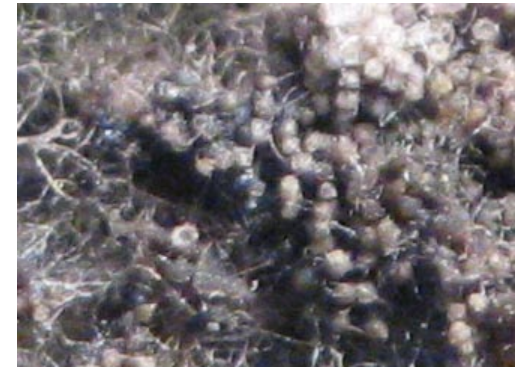
One of this year's "Can You Guess It?" photos. Answer — it is a close up of moldy bread from a 4th grade classroom doing an experiment from a Nutrition Education Program (NEP) School Enrichment kit.