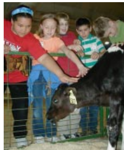
In addition to learning about the care requirements for dairy calves, students had the opportunity to meet a three-week-old calf up close(left).