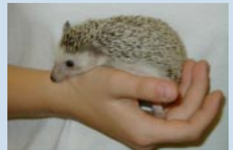
The 4-H Household Pets Show features a wide variety of animals such as hedgehogs (pictured), hamsters, guinea pigs, ferrets, lizards, hermit crabs and canaries.