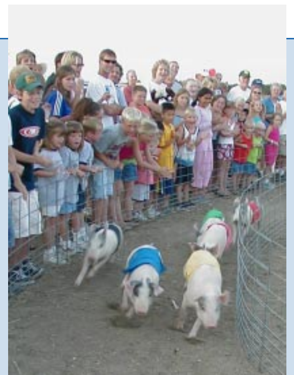
Come cheer for the fastest pig at the Racing Pigs.