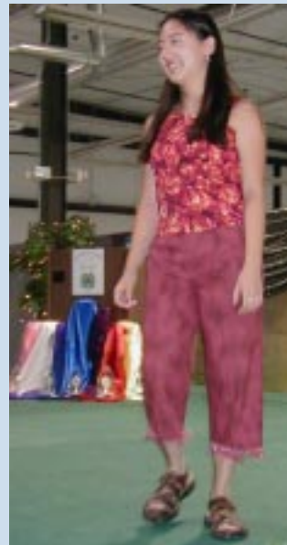
4-H'ers model their clothing projects in the Style Revue.