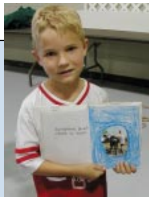
Static Exhibits feature the creative work of hundreds of Lancaster County residents.