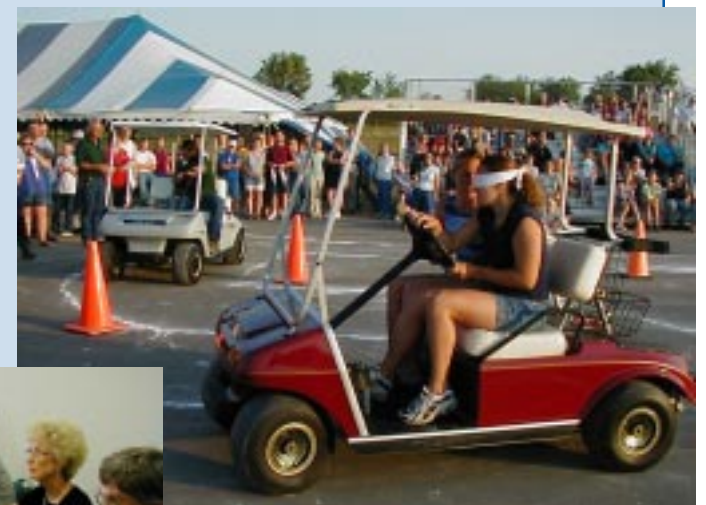
In the Backseat Driver Contest, teams of two drive through an obstacle course in a golf cart — however, the driver is blindfolded and relies on verbal directions from the passenger!