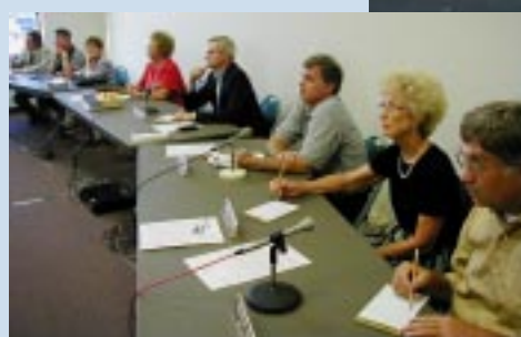
The Town Hall Meeting is a dialogue between the Lancaster delegation of State Senators and the public