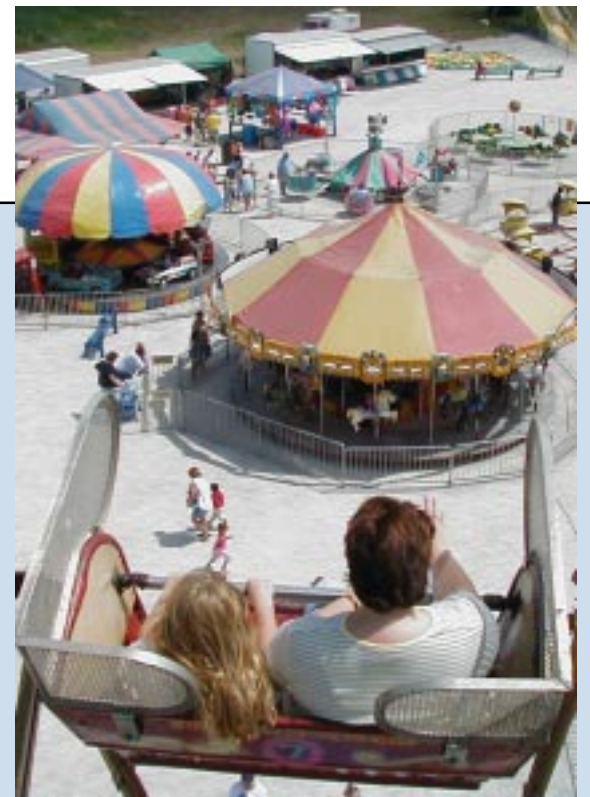
This year's carnival will feature more rides and more thrills!