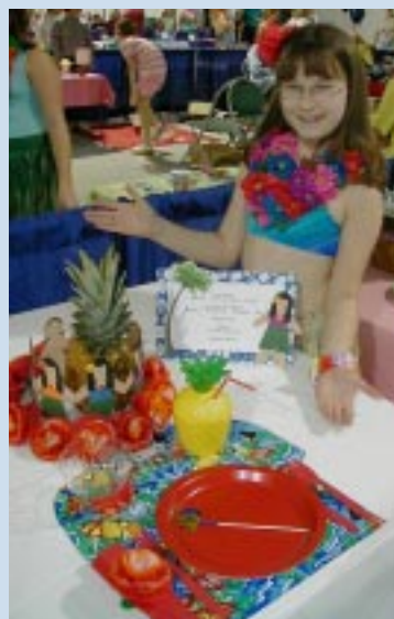
4-H'ers coordinate planned menus and table settings in the 4-H Tablesetting Contest.