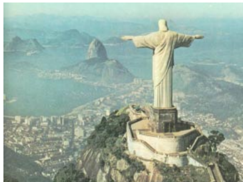
A 100 ft. statue of Christ the Redeemer stands above Rio de Janeiro, Brazil's second largest city.

The United States is Brazil's main trading partner. U.S. investments in Brazil are five times greater than the amount going to China. In 2002, Nebraska exports to Brazil were worth $27 million. Brazil is the world's largest producer of coffee and sugar. It contributes about one-third of the world's oranges and has the second largest herd of cattle in the world. Other major exports include commercial jets, steel, lumber and nuts. Soybean