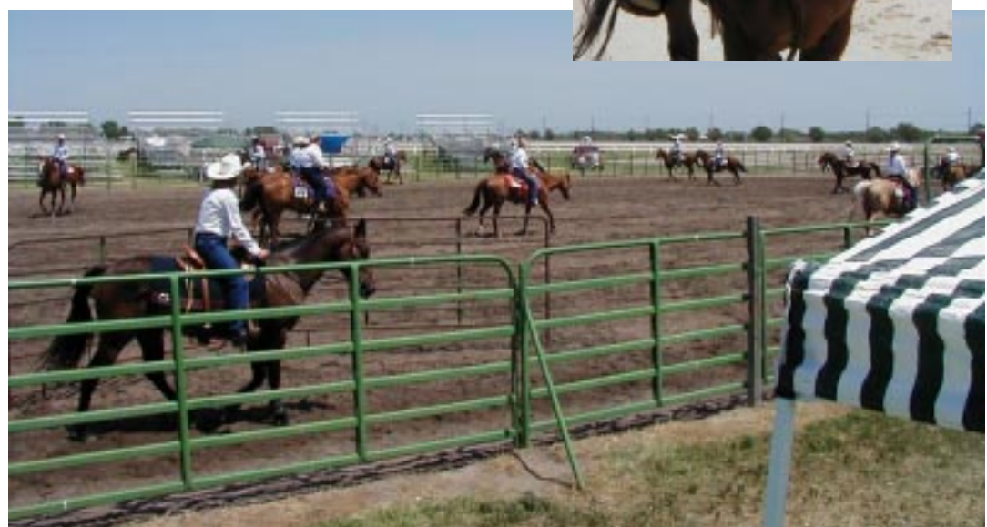
Working Ranch Horse was a new State Horse show class this year with 68 entrants. Exhibitors were given five minutes to guide a steer between a panel and the rail, around a barrel, into a holding pen for five seconds and out the gate. The Lancaster County Fair also had a Working Ranch Horse class for the second year in a row.