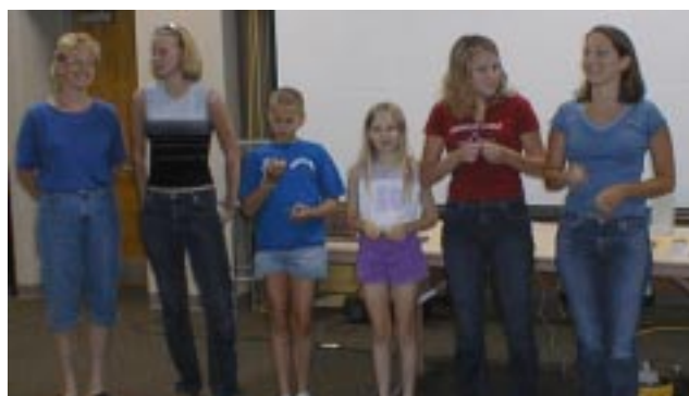
Herdsmanship award winners were the Western Pride 4-H Horse Club. Coming in a close second were the Flying Hoofs.