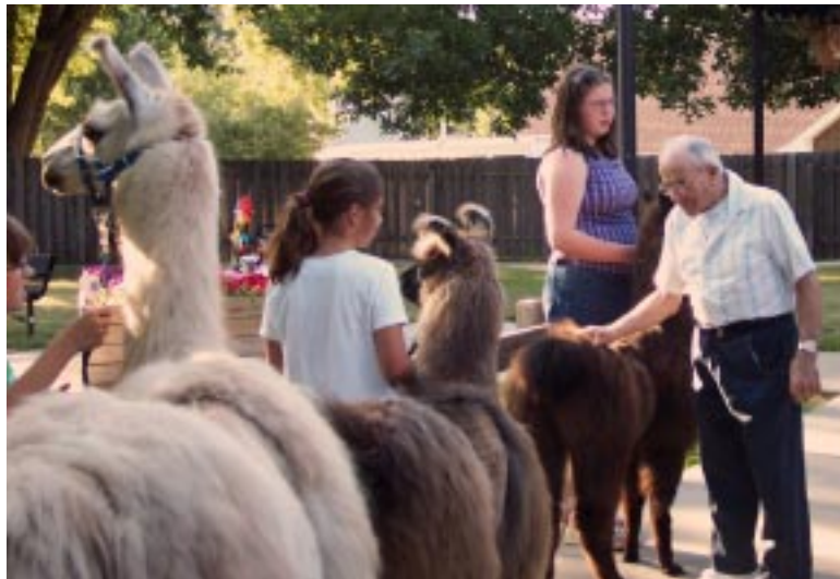
The Star City Llamas 4-H club visited the Alzheimer's unit at Madonna Rehabilitation Center with their llamas.

On June 26, the people at Madonna sure were happy to see some fuzzy, four-legged creatures come walking through the gate of a nice courtyard they have. We stayed with them about half an hour, answering the questions they had, letting them pet and sometimes even walk the llamas. A lot of them were surprised when some of the llamas bent down and blew air in their face while they were petting them. When it was time to go, they all waved goodbye and watched us leave. Events like these are great for both the people and the llamas because the people get to know some things about a rare species of animal in Nebraska and the llamas start to like the attention of strangers. They have a calming affect on both the curious and shy.