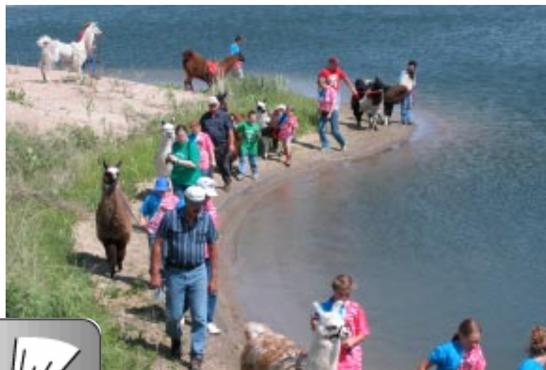
Members of Star City Llamas participated in the annual Llama Trek south of Lexington last month.

On June 22 south of Lexington, is where and when the annual Llama Trek came into action this year. The hike was a short (compared to years in the past) but challenging twisting, turning tall grass "jungle," and a