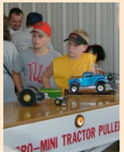
(Above) Two youth anxiously await the next entry at the Micro-Mini Tractor Pull.

The 2002 Lancaster County Fair will host the International Pedal Tractor Pull finals. Last year's winners from all 50 states will compete with competitors from Canada for the International Pedal Tractor Pull championship! Come cheer on the best of the best!