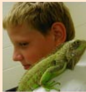
(Above) This lizard clings to his owner in the Household Pet Show.