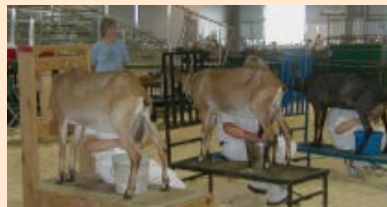
(Above) The goat milking contest is a crowd favorite at the 4-H Goat Show. (Below) In the 4-H Table Setting Contest, youth choose a picnic, formal, casual or birthday theme.