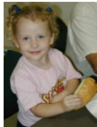
Clowns, concessions and carnival rides are part of what makes a county fair so much fun.