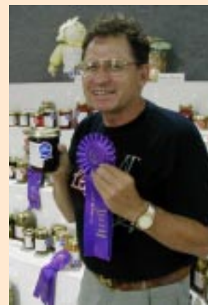
(Right) Winning static exhibits are a source of pride for all ages. (Far right) A youth lassos a steer dummy in the 4-H Horse Roping show. (Below) 4-H'ers model clothing they made during the Style Revue.