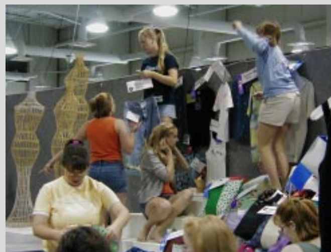
(Left) Though the static exhibits are on display throughout the fair, the true flurry of activity happens during check in and set up. (Below left) A participant poses for the judges during the 4-H Horse Hunter show. (Below) Poultry check in is for the birds.

4-H'ers have the opportunity to talk to judges about their fair exhibits and share the trials and lessons they learned. 4-H'ers also learn what the judge looks for and how to improve skills. This year 4-H'ers may interview judge ONE exhibit from each project area (for example: one item from Celebrate Art, one item from Design Decisions and one item from Tasty Tidbits). Refer to page 5 of the 4-H/FFA Fair Book for project areas that have interview judging. Call the office at 441-7180 to sign up for a five-minute time slot.