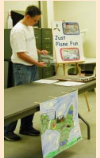
(Above) A FFA member grooms and clips his animal for the Beef Show. (Above right) A youth demonstrates how to make model airplanes in his 4-H Demonstration. (Below right) Completing the obstacle course in the 4-H Bicycle Contest takes concentration and coordination. (Below) Cats in the 4-H Cat Show take home treats, toys, and ribbons.