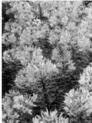
Cleome 'Sparkler Blush'

'Sparkler Blush' flowers freely all season. The plants are covered with pink flowers and are more refined, reaching only 3 feet tall. This smaller size allows gardeners to grow this old fashioned annual in gardens