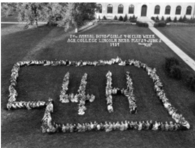
4-H alumni Merna Maahs' scrap book contains this 1939 photo of the 24th Annual Boys and Girls 4-H Club Week.