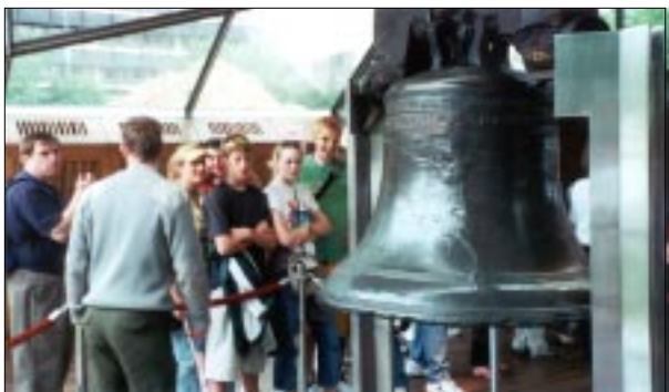
The Liberty Bell in Philadelphia was one of the stops on the way to D.C.