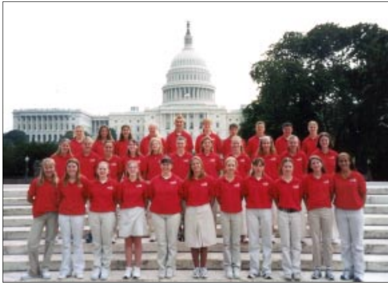
32 Lancaster County 4-H teens participated in this year's Citizen Washington Focus trip.