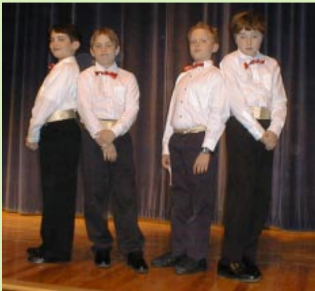
Dawes Middle School, 5130 Colfax Avenue Everyone is welcome to attend! Join the fun and watch talented 4-H members.