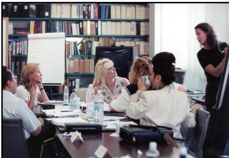
"Training involves practical hands-on learning and discussion."