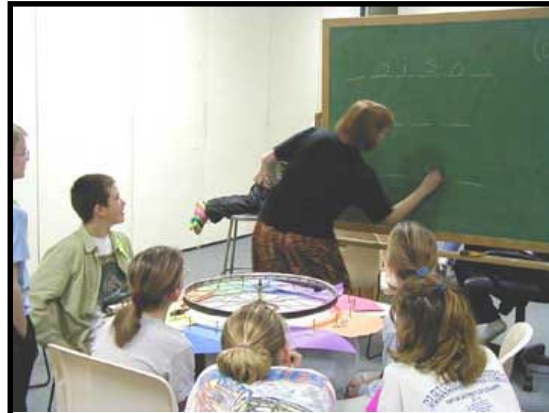
Wheel of Fortune anyone?