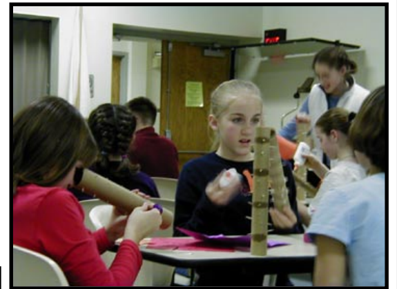
Lock-in participants trying their hand at making rainsticks.