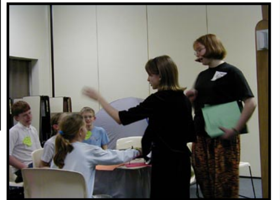
Teen Council members leading a small group workshop.