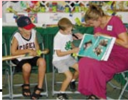
Youth Groups, Activities, and Schools