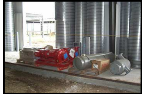
Ventilation equipment/units ready for installation.