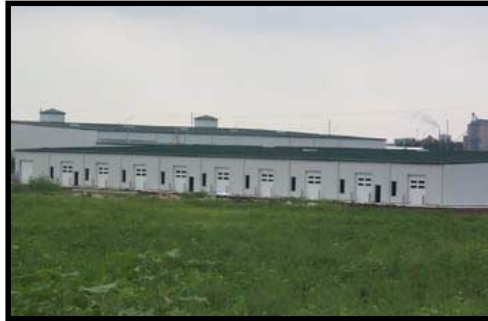
Pavilion I nears completion with exterior doors installation complete.

• Over 170 facility user days have been designated from February 1 through December 1, 2001. (GB)