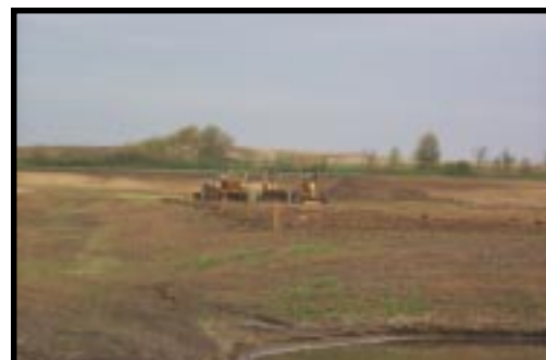
Grading for the Amy Countryman Outdoor Arena.

Steel frame work for Pavilion one and two is completed and nearly completed for