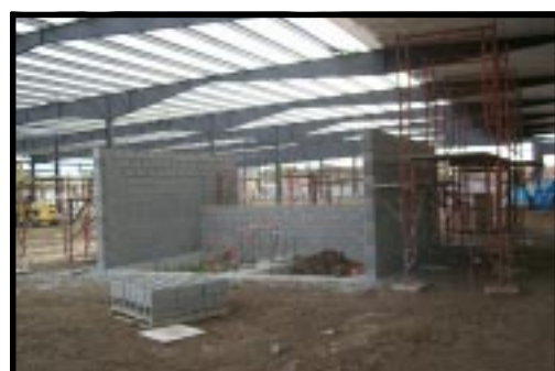
Animal wash bays.