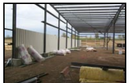
Exterior wall under construction.