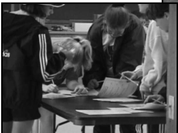
"I can't afford house payments. I need to look for an apartment."