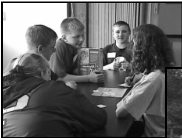
"How many careers are involved in making a box of raisin bran?"