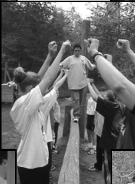
"Teamwork during leading with character counts!"