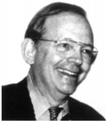
Anthony Lake, Featured Speaker Superpower or Supercop: Dangers and Opportunities in the Post Cold War Era March 9, 1999

Widely traveled in his diplomatic and academic career, Lake served as U.S. Vice Consul in Saigon and Hue (1963-1965), as an aid to Henry Kissinger from 1969-1970 and as director of Policy Planning in the State Department (1977-1980). He is uniquely positioned to shed light on what has been described as the fragile stability of our post cold war period, examining economic and political opportunities and dangers in an era of global communications and markets. He is the author of "Somozas Falling" and "Our Own Worst Enemy: The Unmaking of American Foreign Policy," and was contributing editor of "Legacy of Vietnam: The War, American Society and the Future of U.S. Foreign Policy." (GB)