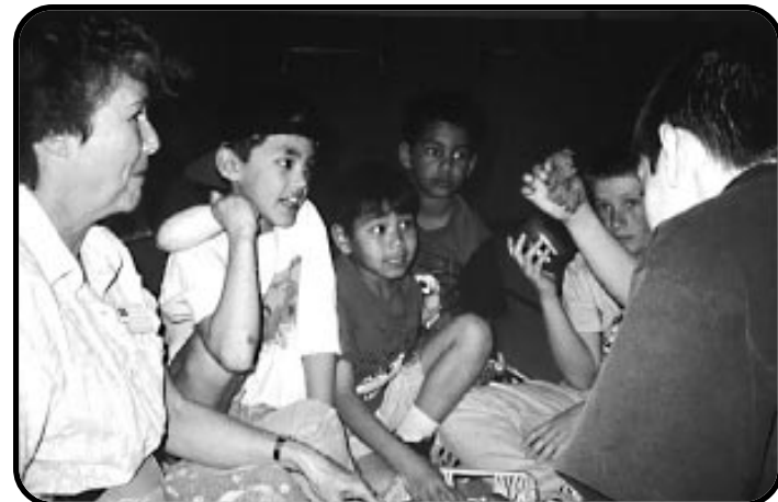
EFNEP/4-H members feel, smell and taste vegetables.

Nutrition advisors presented 57 nutrition education programs to students at various before and after school childcare sites and community centers. The three-part series called "Five-A-Day