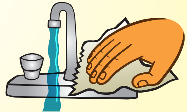
6 Turn Off Water with Paper Towel