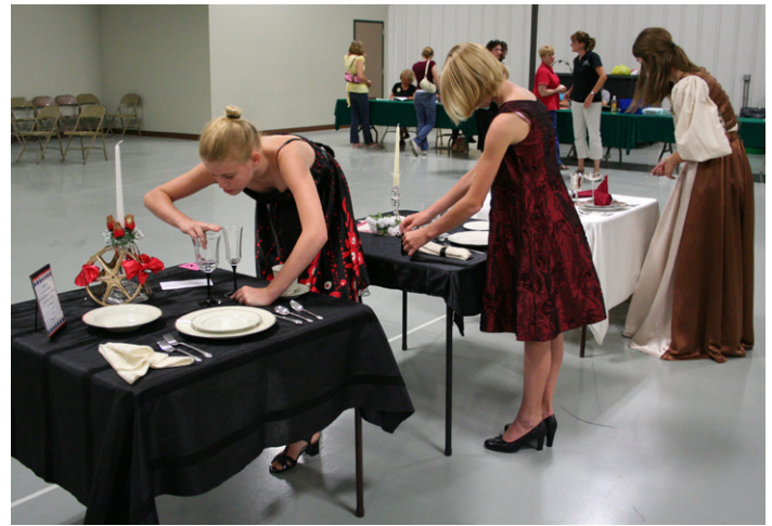
Table Covering — This is the background for the food and table appointments placed on it. It protects the table and makes for less noise. Placemats and/or tablecloths may be used. Sometimes the table is left bare. Choose a covering which is appropriate for the occasion and the other table appointments. You may match or blend colors and textures in the dishes — or use something quite different for contrast.

Table Appointments — These include any item used to set a table: tablecloth, placemats, dinnerware, glassware, flatware, and centerpiece. Choose table appointments to fit the occasion and carry out the theme. Paper plates, plasticware, and paper napkins may be used for a picnic but they would not be appropriate for a formal dinner. Flatware and dishware must be safe to eat from i.e., no glitter, glue, etc. is to be used on eating surfaces.