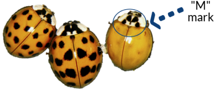
Multicolored Asian lady beetle

Can be a variety of colors (e.g. yellow, orange, red) and have many spots or none at all; always look for the solid or broken "M" on thorax