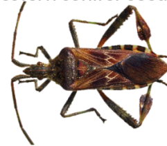
Western conifer seed bug

3/4-inch long, dark brown and with yellow squares along the edge of the abdomen; back legs are partially flattened and look like boat paddles