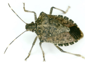
Brown marmorated stink bug

1/2-inch long and brown with yellow/white dots all over body, and a white band near antennae tips